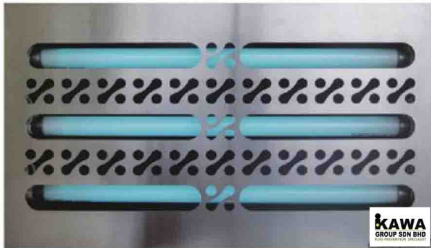
IKAWA PRO IK-DIS45 INSECT TRAP

Compared to existing glueboard nature flies control unit in the market, this unit has a wider glueboard and bigger glueboard . This large area with glue adhesive board are able to resolve the problems of limited catch possibilities.