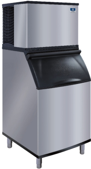
M700 Ice Machine on A570V Bin

Model: MD0700A-251B MY0700A-251B MD0700W-251B MY0700W-251B