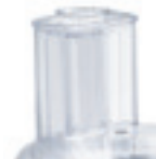
FEED TUBE & FOOD PUSHER