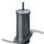
STAINLESS STEEL BLADE