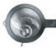
LID WITH DRIZZLE BASIN