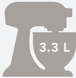
3.3 L KitchenAid Mini Stand Mixer