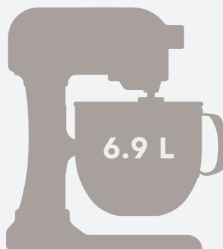
6.9 L KitchenAid Stand Mixer

Know your bowl size. 3.3 L up to 6.9 L to choose from.