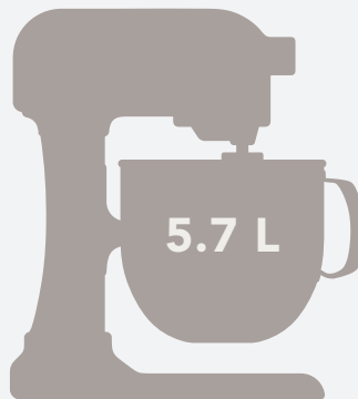
5.7 L KitchenAid Stand Mixer