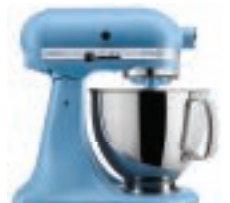
MATTE BLUE VELVET