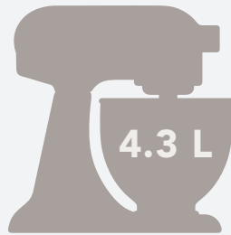
4.3 L KitchenAid Mini Stand Mixer