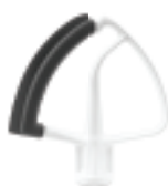
FLAT EDGE BEATER