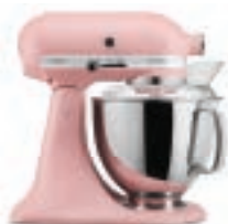
MATTE DRIED ROSE