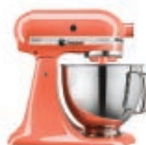
BIRD OF PARADISE