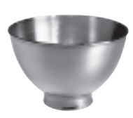
3 L STAINLESS STEEL BOWL