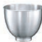
STAINLESS STEEL BOWL

*Compared to full size KitchenAid Tilt-Head Stand Mixers.