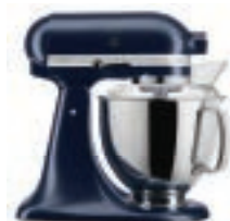
MATTE INK BLUE