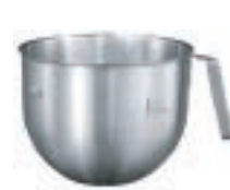
STAINLESS STEEL BOWL