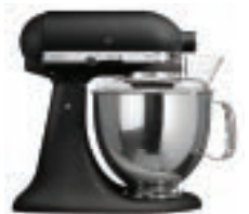
CAST IRON BLACK