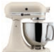
MATTE FRESH LINEN