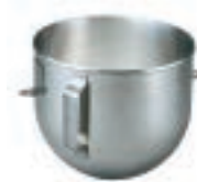
STAINLESS STEEL BOWL