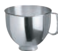
STAINLESS STEEL BOWL