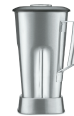
CAC90 2 liter, stainless steel container