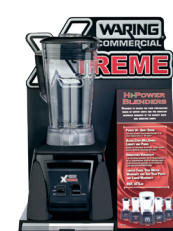
MXXTDS Display For all blenders in Waring® Commercial Xtreme Series