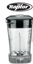
CAC93X 1,4 liter, BPA-free copolyester container