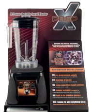
XPREDIS Display For Waring® Commercial X-Prep Series