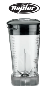
CAC95 2 liter, BPA-free copolyester container

All units available with the following jars, sound enclosures and display.