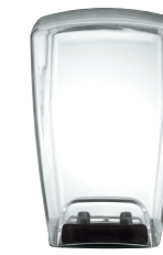
SE1000 Large sound enclosure Retrofits all blenders in Waring® Commercial Xtreme Series – 2 liter containers