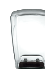
SE500 Small sound enclosure Retrofits all blenders in Waring® Commercial Xtreme Series – 1,4 liter containers