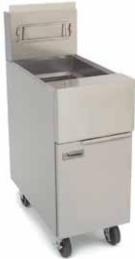
GF40 Shown with casters